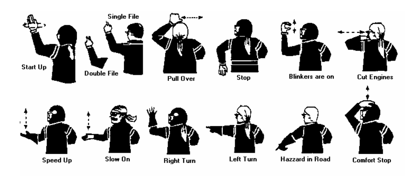
FIGURE 3 -- HAND SIGNALS

If anyone does not feel comfortable with riding in the group with the expectations mentioned in these guidelines, that person should pull out of the group and follow at a comfortable distance behind the group. Each and every person is responsible for his or her own safety at all times.